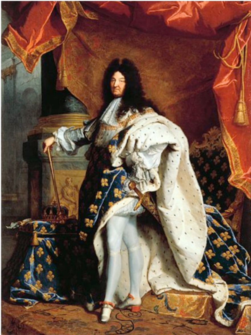
King Louis XIV of France 1638-1715